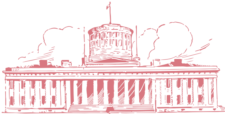
Ohio Bleeding Disorders Council Statehouse Day

Each year, the Ohio Bleeding Disorders Council hosts Statehouse Day, where people affected by bleeding disorders educate their state elected officials about issues important to the Ohio bleeding disorders community.