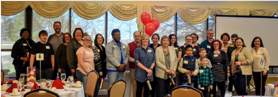
All SWOHF Volunteers attending were recognized at our Annual Meeting.