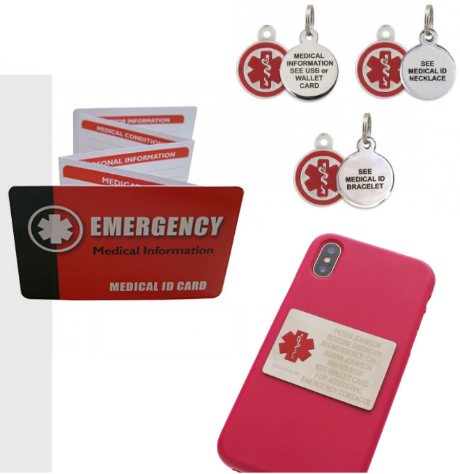
[Phone not included]

SWOHF is grateful for grant funding and donations that facilitate these purchases on behalf of our Greater Dayton Bleeding Disorders Community. So when you go to the HTC for your next visit, you can view sample products available and complete a form to request a new bracelet or necklace according to Chapter guidelines.